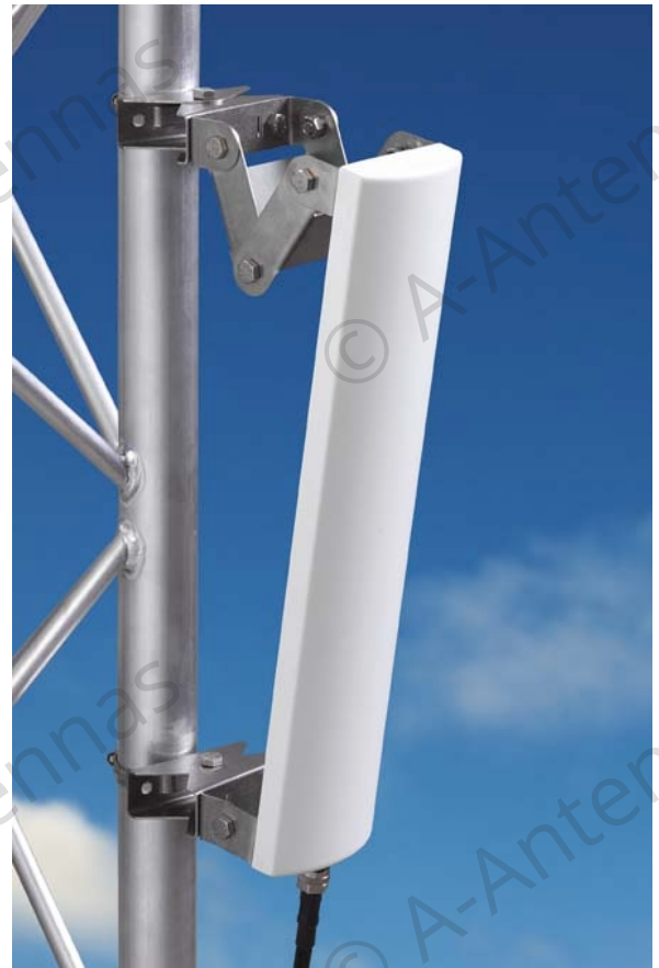
Pictured with optional tilt mount.